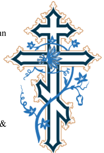
The Procession of the Precious & Life-giving Cross

DORMITION FAST BEGINS: Until the time of the Feast of the Dormition, the Falling Asleep of the Most Holy Mother of our Lord on Sunday, August 28 th , we honor the fast and are instructed & encouraged to abstain from certain foods at this time, as physically able. The minimal fast includes abstaining from the eating of meat.