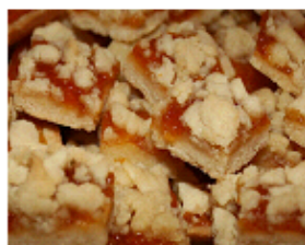
A sampling of cookies & confections