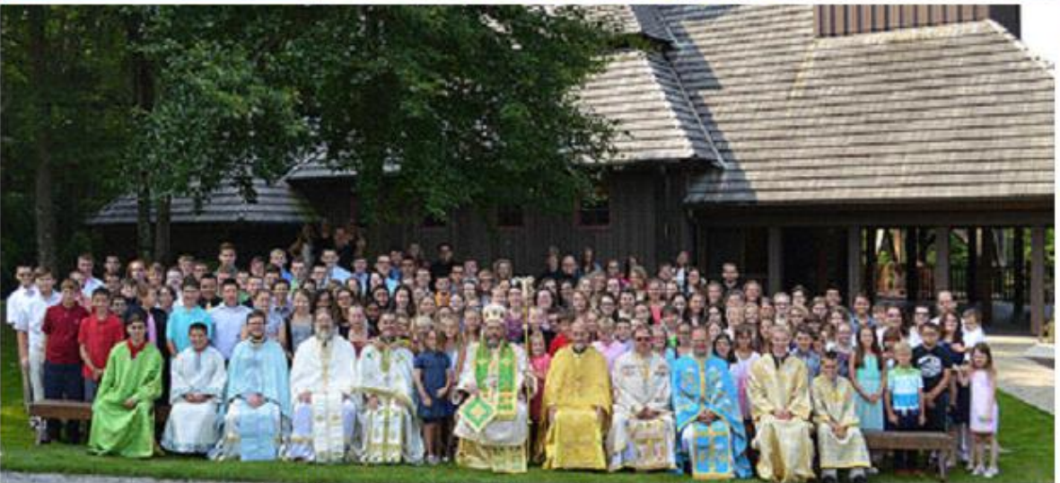
New England/New York/New Jersey/Florida/Canada Deaneries July 28 - August 2 2014